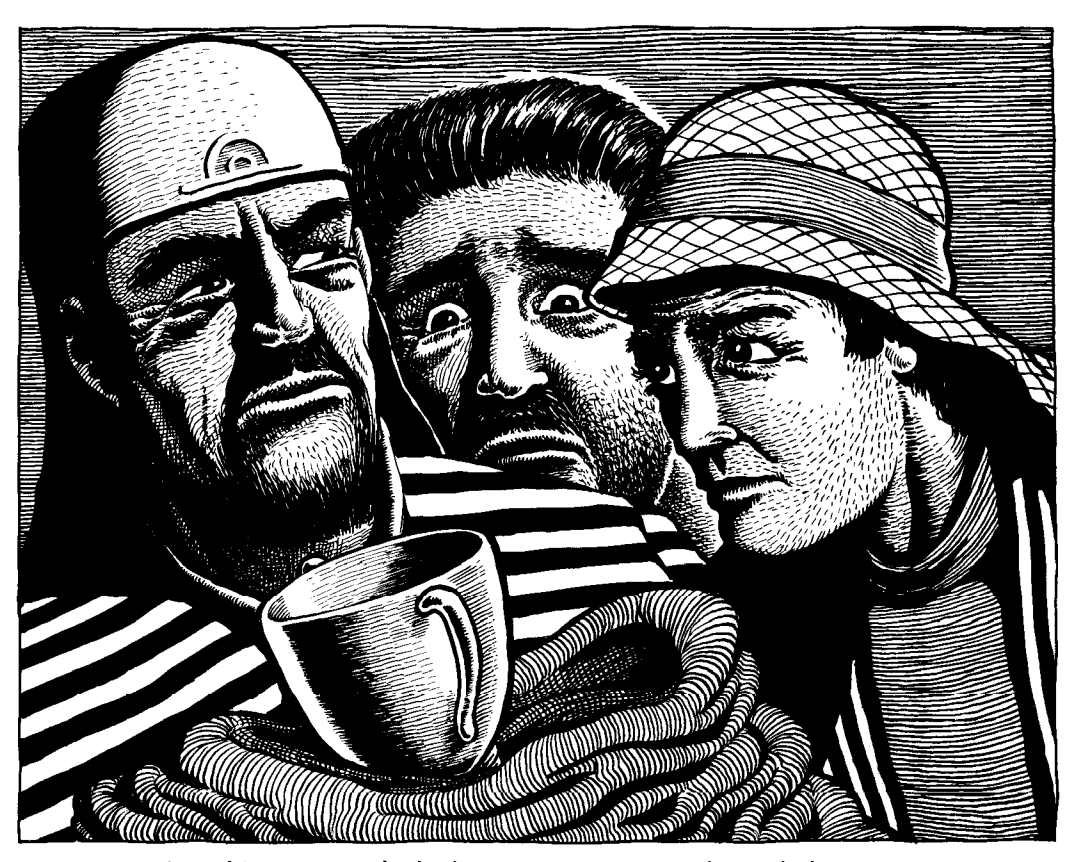
Joseph's servants looked into Benjamin's sack, and there was the missing silver cup!

found in their sacks! And, what was worse, the valuable silver cup was found in Benjamin's sack! (Verse 12.)