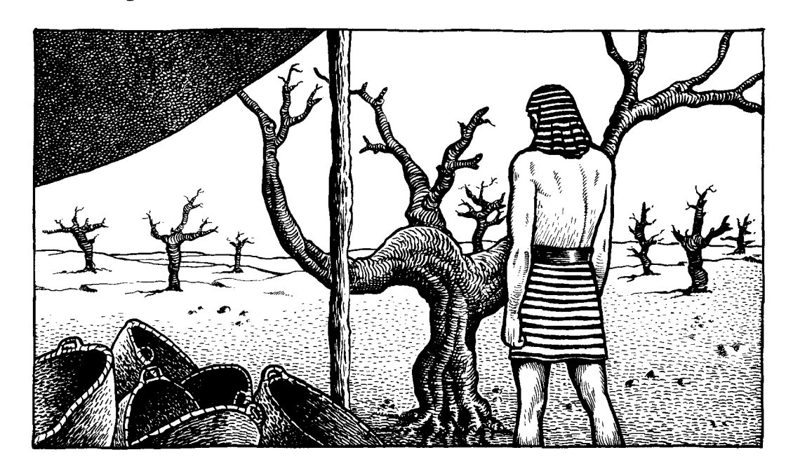
Dry east winds blowing steadily year after year turned the once green fields and orchards into vast areas of yellow despair.

At last the food supply which they had bought from Egypt became very low. Then Jacob could do only one thing—tell his sons that they should return to Egypt after more grain. (Gen. 43:1-2.)